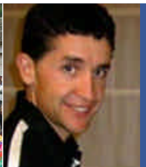
Carlos Sastre SPAIN SPORT

Doctor Rigoberta Menchu Tum, from the K'iche-Maya indigenous group was recognised in 1992 with the Nobel Peace Prize. "I want to send a very special greeting to all the friends who are generating this energy around the whole world [...]. Above all I want to call on young people to participate in this movement for peace, [...] so they can make a better world, participating in global action like these."