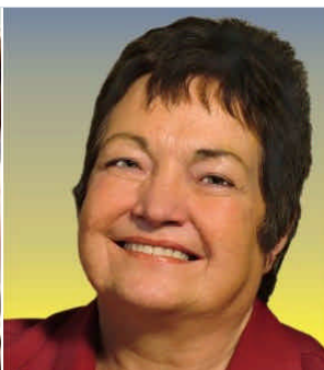
Mairead C. Maguire UNITED KINGDOM NOBEL PRIZE

She co-founded the Community for Peace People in Northern Ireland and co-organised a march with 35,000 people onto the streets of Belfast. She believed the most effective way to end the violence is the re-education. Nobel Peace Prize in 1976 continues her work as a member a network of Women Nobel Peace laureates and trying to bring an end to the violence between Israel and Palestine.