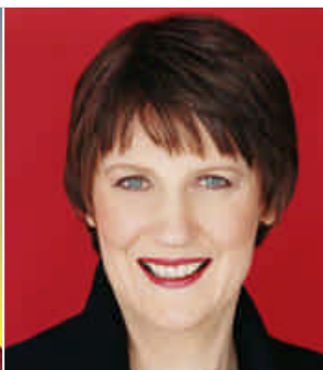
Helen Clark NEW ZEALAND GOVERNMENTS

She co-founded the Community for Peace People in Northern Ireland and co-organised a march with 35,000 people onto the streets of Belfast. She believed the most effective way to end the violence is the re-education. Nobel Peace Prize in 1976 continues her work as a member a network of Women Nobel Peace laureates and trying to bring an end to the violence between Israel and Palestine.