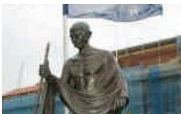
The statue of Gandhi

This is also a pioneering country in the defence of pacifism and nonviolence: it was the first country in the world to give the vote to women; to be declared as a country free from nuclear weapons after a civil campaign led to the US withdrawing their bases; to have given equal civil rights to ethnic minorities even before the start of the 20th century; and to have been pioneers in the defence of the environment, since the times of Rainbow Warrior. The proposal for the World March to officially set off from here has been very well received by associations and institutions, and there are already teams working in Auckland, Wanganui and Wellington to make the start an event with global repercussions. People such as Helen Clark, former Prime Minister and current Director of Development Projects at the United Nations and the Mayor of Wellington, Kerry Prendergast, are among the political personalities and diplomats that are