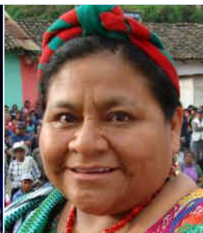
Rigoberta Menchú Tum GUATEMALA NOBEL PRIZE

He is best known for his life-changing experience seeing the planet Earth from space on his Apollo XIV mission in 1971. He is the founder of the Institute of Noetic Sciences, which sponsors research on the nature of consciousness. "I endorse The World March for Peace and Nonviolence and its efforts to bring awareness to governments and people worldwide to end wars, occupations and violence of all kind."