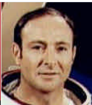
Edgar Mitchell UNITED STATES ASTRONAUT

Member of the New Zealand Labour government which introduced peace studies into the school curriculum, and which prohibited nuclear weapons, then Prime Minister, she launched the Global Campaign for Peace Education. Honorary member of Parliamentarians for Nuclear Nonproliferation and Disarmament and of the Council of Women World Leaders, she currently heads the U.N. Development Programme.