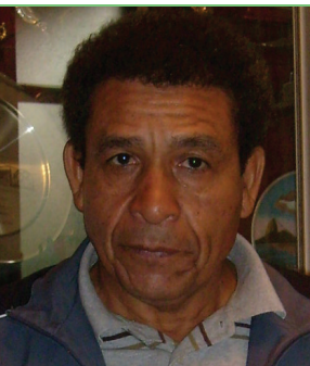
Héctor Chumpitaz PERU SPORTS

Internationally famous dancer and choreographer at the Paris Opera Ballet for more than 10 years. "Imagine that the whole world joined hands and surrendered their selfish desires of power, borders, and glory. We of the same breathing air of existence, a shared cosmic lung of survival, being of the same breath in the other's blood. Reflections of mercy."