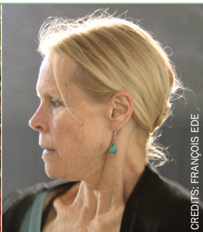
Carolyn Carlson FRANCE MUSIC

Isabel Allende is the author of The House of the Spirits, Eva Luna and Paula, among many other works. Before that she was a journalist for a Chilean women's magazine, for TV shows and movie documentaries. She has earned numerous honours around the world, both as a writer and as a feminist. Ms. Allende has also earned Honorary Degrees in her native Chile, in the United States and Italy.