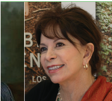
Isabel Allende CHILE LITERATURE

At the end of the event the participants formed a Human Peace Sign in Independence Square.