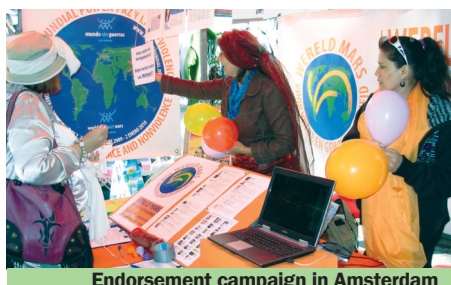
Endorsement campaign in Amsterdam