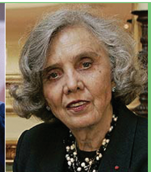
Elena Poniatowska MEXICO LITERATURE

David Suzuki is a Canadian science broadcaster and environmental activist. He is best known as host of the popular and long-running TV series, The Nature of Things, seen in over forty nations. He is also a well-known critic of government inaction to protect the environment, and the author of over forty books.