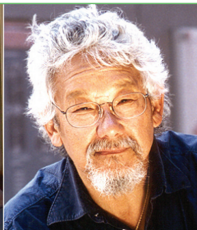
David Suzuki CANADA ECOLOGY

Chumpitaz is a famous Peruvian former footballer. "I call upon all people to take part, all colleagues from sport in general, from all disciplines, because this March is going to be important so that we see that between human beings we have to have friendship, care, appreciation. I call on all people, especially Peruvians, to support this great March for Nonviolence."