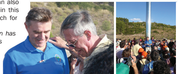
The Hall at Toledo Park, de la Rubia with Silo and the Monolith

more contribution, to decisively leave behind human prehistory."