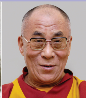
Dalai Lama INDIA NOBEL PRIZE WINNER

In 2009 she became the first Spanish actress to win an Oscar with the film "Vicky Cristina Barcelona" directed by Woody Allen. She has appeared in almost 50 films, many of which directed by Pedro Almodovar. Among her most popular films are Vanilla Sky , Vicky Cristina Barcelona , Volver , Blow , Broken Embraces , Don't Move , Belle Epoque , The Girl of your Dreams and All About My Mother .