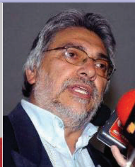
Fernando Lugo PARAGUAY POLITICS

His holiness the XIV Dalai Lama, Tenzin Gyatso , is the spiritual leader of Tibet. He lives in exile in Dharamsala in the north of India. In 1989 he was awarded the Nobel Peace Prize which lead to his international fame. He has been the subject of various Hollywood films ( Seven years in Tibet and Kundun ) and numerous TV documentaries and programmes.