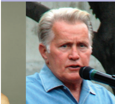
Martin Sheen USA TV-CINEMA-THEATRE

He declared that his government and the Ecuadorean people will receive the World March base team as it passes through Quito on the 18th of December. And he ended with a call for all political, social, cultural and religious leaders of the world to endorse the March, and a poem by Rafael Alberti .