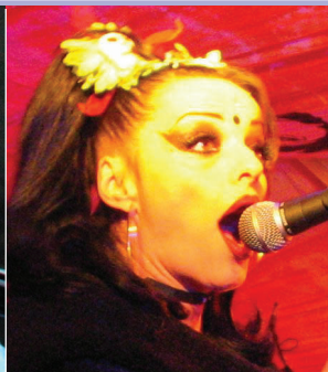
Nina Hagen GERMANY MUSIC

Martin Sheen is best known for his performances in the film Apocalypse Now and on the television series The West Wing . As well as the critical acclaim he has received as an actor, he is an activist and supporter of social justice.