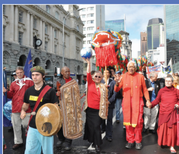
The Base Team in Rekohu and Marching in Auckland.