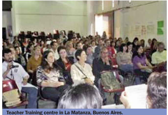
Teacher Training centre in La Matanza, Buenos Aires.

The variety of initiatives became clear in the subsequent inter-