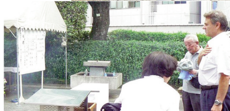
Images from the memorial events to the victims of Hiroshima and Nagasaki

the annual assembly of "Mayors for Peace", gathering together more than 3000 mayors from cities on all continents. The organisation, currently and until 2020, is developing a campaign for nuclear weapons abolition, through the signing of the Hiroshima and Nagasaki Protocol by politicians. This meeting is very important in the build up to the United Nations conference to review the Nuclear Non-Proliferation Treaty that will happen in May next year.