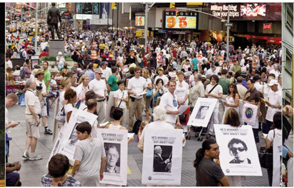
NEW YORK, UNITED STATES